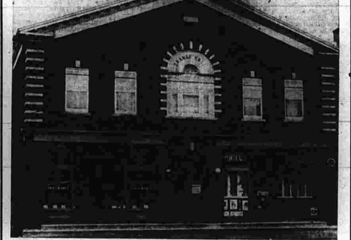
Paramount makes combination screens and storm sash to fit all windows as demonstrated on this job at the Orange Hall Block where window sizes were varied and "out-size" as far as modern windows go. This is one of the largest commercial jobs ever done in town.